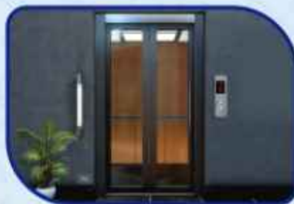
10 PASSENGER LIFT