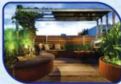
ROOF TOP GARDEN