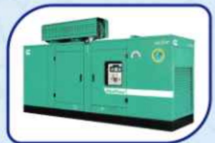
24X7 POWER BACKUP